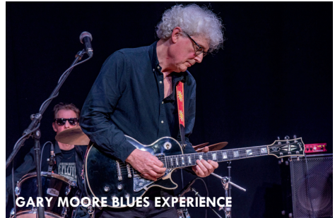
GARY MOORE BLUES EXPERIENCE