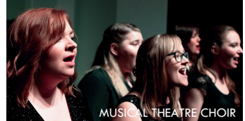
MUSICAL THEATRE CHOIR