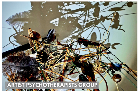
ARTIST PSYCHOTHERAPISTS GROUP